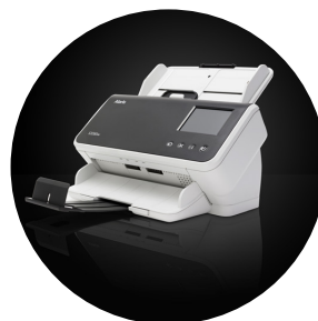
Alaris S2060w/S2080w Scanners