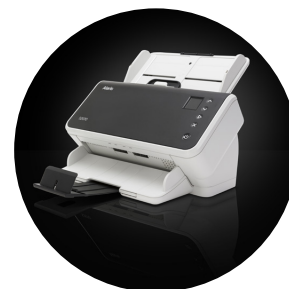
Alaris S2040/S2050/S2070 Scanners